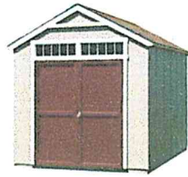
Handy Home Products Installed (27)