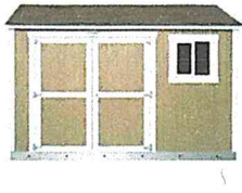
Tuff Shed Installed Tahoe 10 " " " " (20)