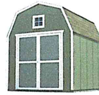
Handy Home Products Installed (9)