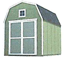
Handy Home Products Installed (18)